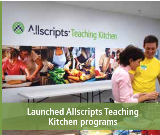
Launched Allscripts Teaching Kitchen programs