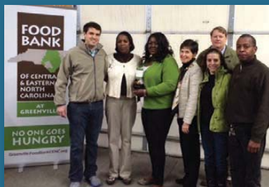
Greenville staff celebrates 100 million pounds distributed.

When the Salem Missionary Baptist Church Food Pantry arrived at the Food Bank's Greenville Branch to shop for food items for their pantry, they had no idea that they would be part of history. As Food Bank staff loaded food items onto the scale, the Greenville Branch, in operation since 1999, hit the milestone of 100 million pounds of food distributed. This is equivalent to more than 84.2 million meals. The Branch distributes food to rescue missions, soup kitchens, food pantries, after-school programs, and elderly nutrition programs in 10 counties: Carteret, Craven, Edgecombe, Greene, Jones, Lenoir, Onslow, Pamlico, Pitt, and Wilson counties.