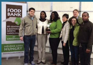
Greenville staff celebrates 100 million pounds distributed.

When the Salem Missionary Baptist Church Food Pantry arrived at the Food Bank's Greenville Branch to shop for food items for their pantry, they had no idea that they would be part of history. As Food Bank staff loaded food items onto the scale, the Greenville Branch, in operation since 1999, hit the milestone of 100 million pounds of food distributed. This is equivalent to more than 84.2 million meals. The Branch distributes food to rescue missions, soup kitchens, food pantries, after-school programs, and elderly nutrition programs in 10 counties: Carteret, Craven, Edgecombe, Greene, Jones, Lenoir, Onslow, Pamlico, Pitt, and Wilson counties.