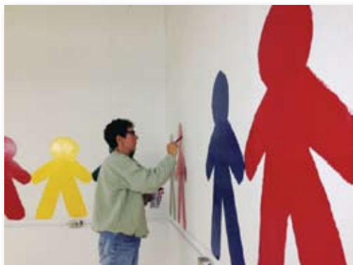
A volunteer brings life to the new Durham building.

Doors will open in April. Another $100,000 is required for the Durham Branch to complete all aspects of the expansion and be able to best serve the nearly 100,000 individuals in need in its six-county service area.